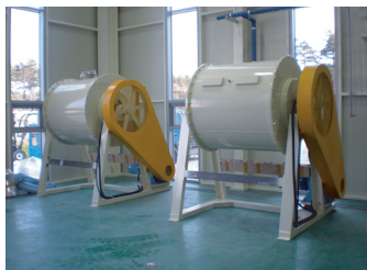
Raw material preparation